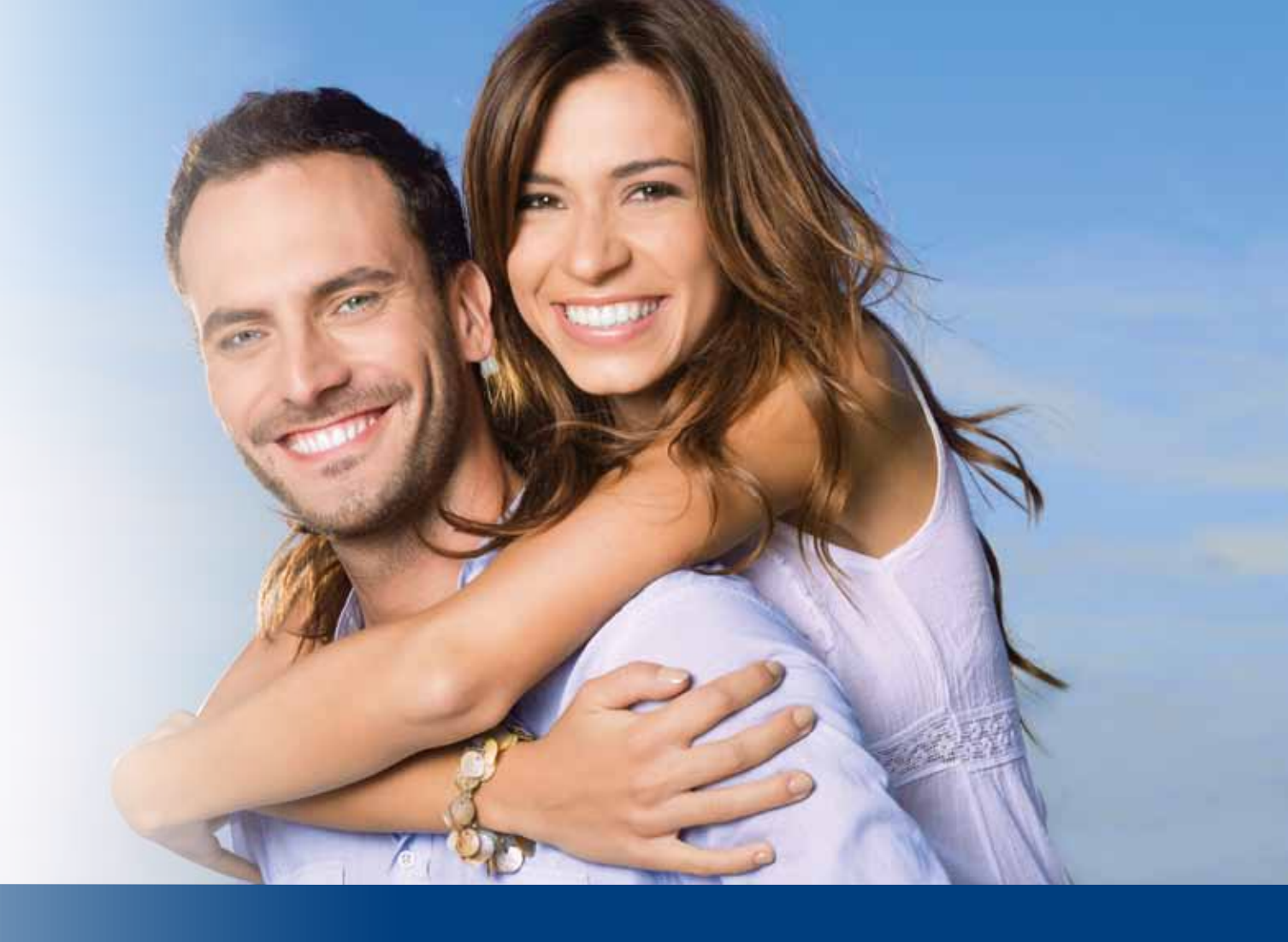
Personal Paycheck Power<sup>SM</sup>