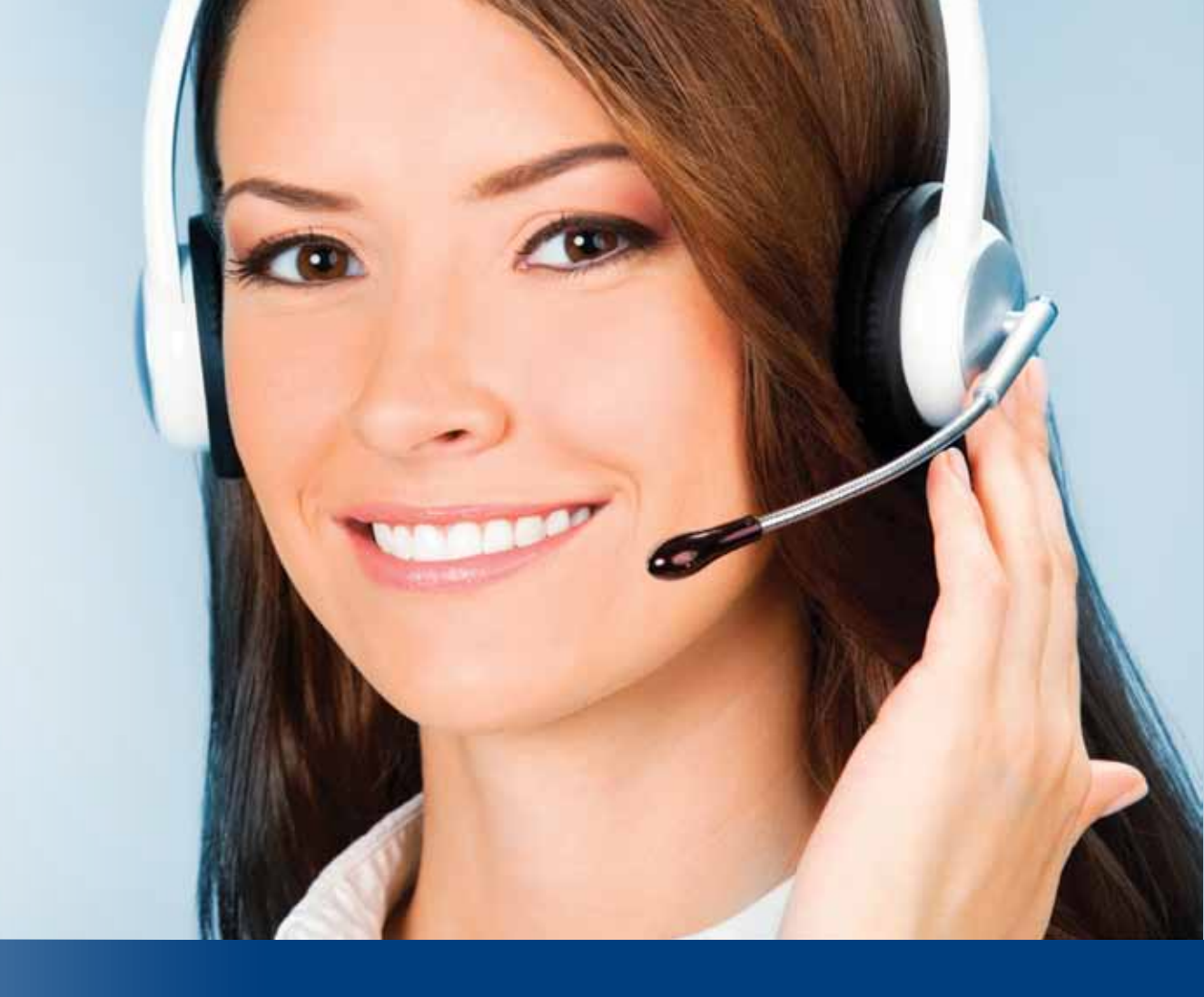
Illinois Mutual - Your Back Office Support