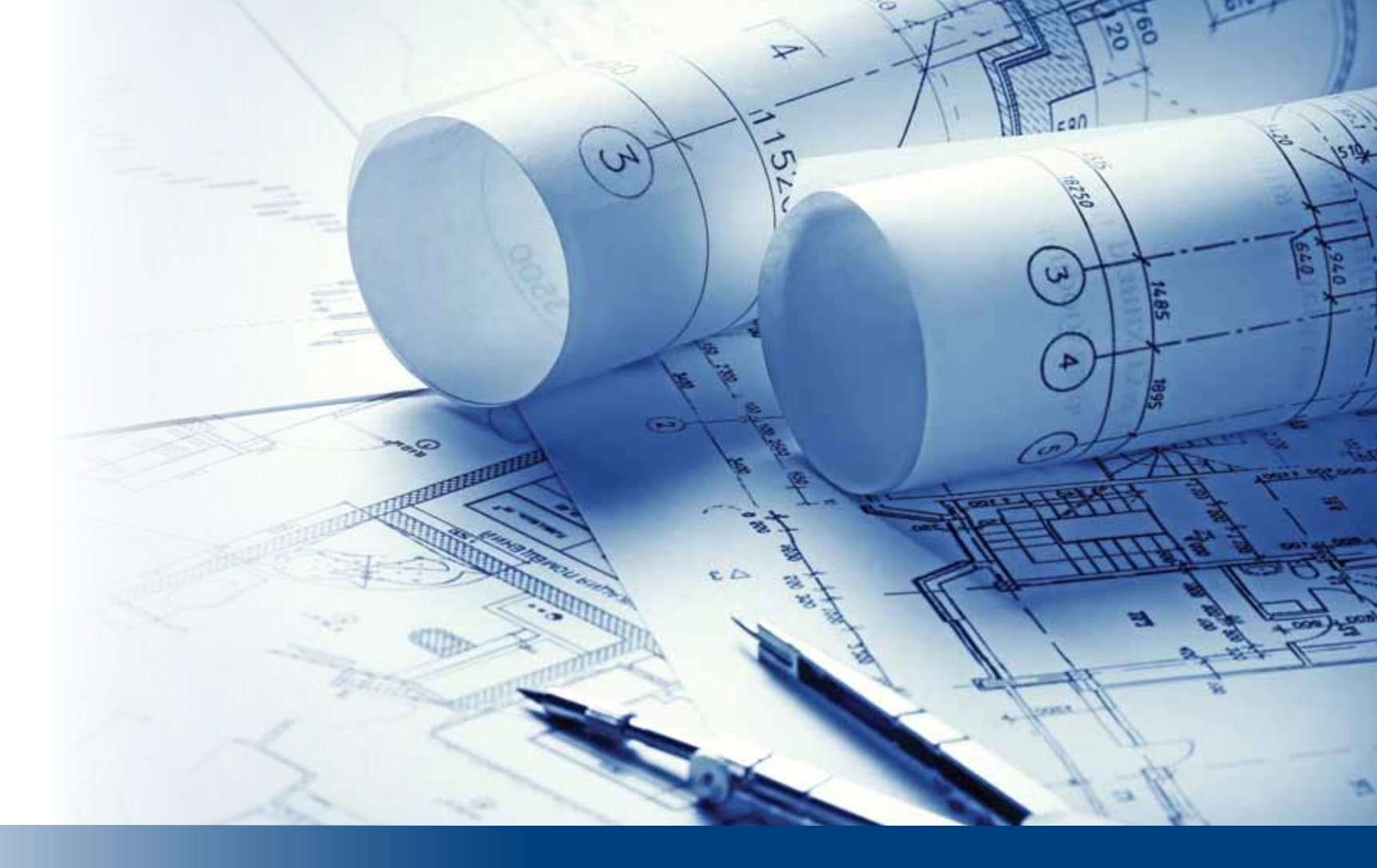
3 Simple Steps to Build a Plan